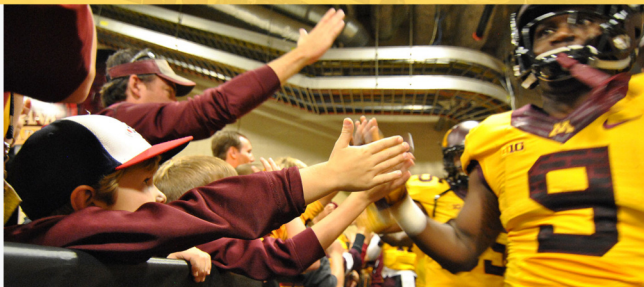
Gopher Loyalty Program • 2017-18 Benefits • Tunnel Team